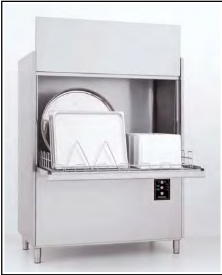
Accessories not included